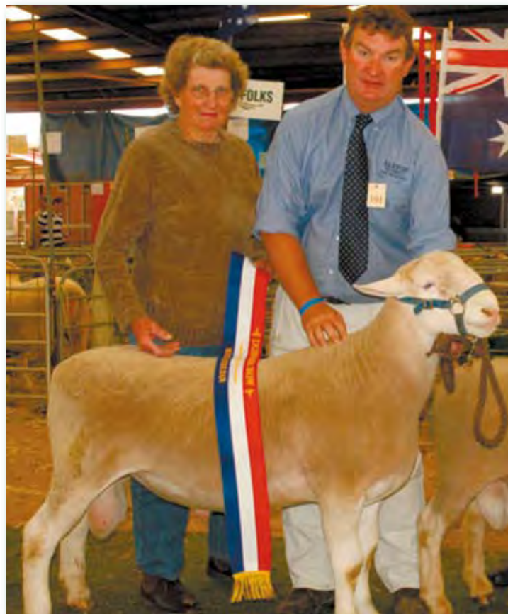
Kubura 070063 Champion White Suffolk Ram at Dubbo Show in April.

This was one of our most proud moments in breeding White Suffolk sheep. The judges commented on the massive, superbly structured ram—the photo says it all!